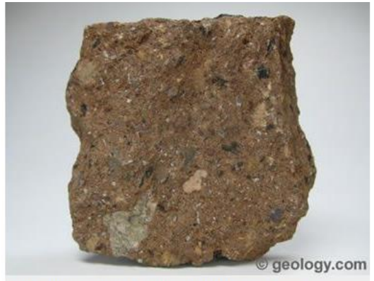
Tuff: An igneous rock that contains the debris from an explosive volcanic eruption. It often contains fragments of bedrock, tephra, and volcanic ash. The specimen shown here is about two inches (five centimeters) across.

Some tuff deposits are hundreds of meters thick and have a total eruptive volume of many cubic miles. That enormous thickness can be from a single eruptive blast or, more commonly, from successive surges of a single eruption - or eruptions that were separated by long periods of time.