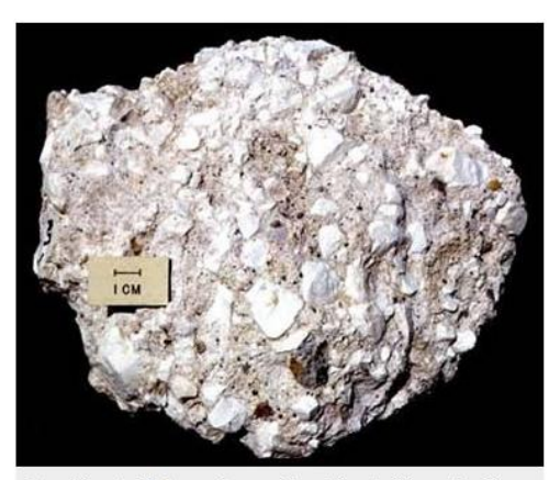
Beryllium tuff: A specimen of beryllium tuff from the Spor Mountain area of Utah. It is a porous tuff with abundant fragments of carbonate rock. Beryllium has been mined at Spor Mountain from stratified tuffs. [3]